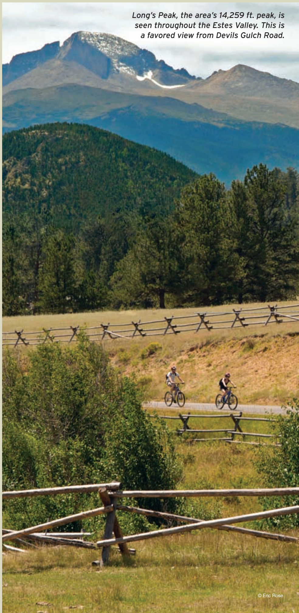
Long's Peak, the area's 14,259 ft. peak, is seen throughout the Estes Valley. This is a favored view from Devils Gulch Road.

For other fun, check out our list of Favorite Things To Do beginning on page 16.